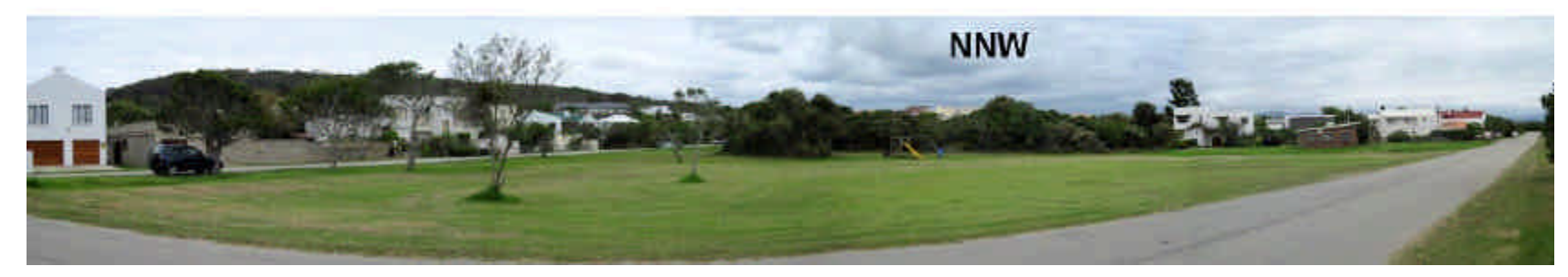
Plate 1. Panoramic views of Erf 705 showing disturbances and vegetation cover. Compass bearing names indicate bearing point in view.