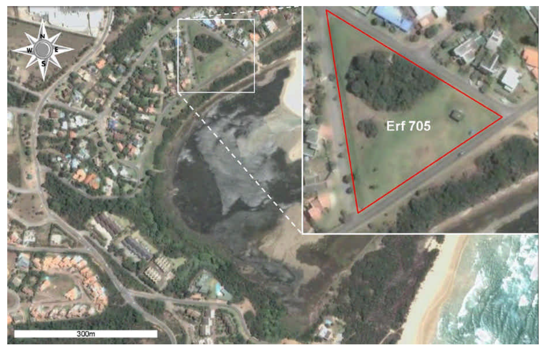
Figure 2. Enlarged area as indicated in Figure 1 showing the location of Erf 705, it proximity to the high water mark, disturbances and vegetation cover.